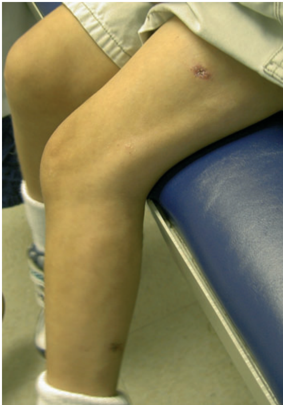
Figure 1. Hyperpigmented, shiny, tightly bound-down plaques of the lower extremities.

Nephrogenic systemic fibrosis is a relatively rare, recently described entity which affects patients with renal dys-